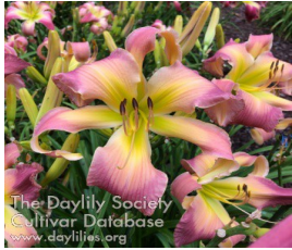
Baiting for You