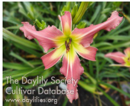
Elizabeth in Pink

S. Holmes (2016) 36" x 7" bloom. ML, DOR, TET. UF Crispate-cascade. Dark pink with clear green throat, pinched petals and sepals that roll back, lightly ruffled edge