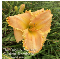
Later Than You Think

S. Holmes (2022) 32" x 6" bloom. L, DOR, TET. Blend of pink, shades of yellow, and orange with jagged, golden yellow edge, strong scapes, blooms well above foliage.