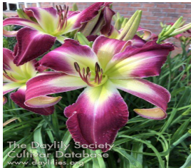
Flirts in Skirts