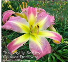
For All The Care Givers

S. Holmes (2023) 38" x 7.5" bloom. M, SEV, TET. Lavender with bluish tones in eye fading to cream, green blending to yellow throat into petals, slightly recurved petals and sepals, open form