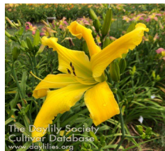
Just for Kevin

S. Holmes (2023) 45" x 8.5" bloom. ML, DOR, TET. UF Crispate. Bright dark yellow with deep green throat, slightly ruffled petals.